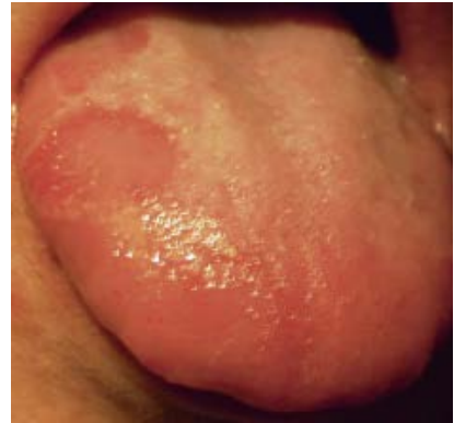
MY TONGUE WITHOUT B-12 INJECTIONS

Later, I learned how to give the injections to myself so I wouldn’t have to go to the doctor’s office so often. That was my first clue that some vitamins can affect your tongue. I also discovered that I needed weekly injections rather than the monthly ones I was getting from the doctor.